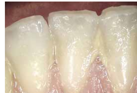
High-resolution images reveal even the tiniest details.