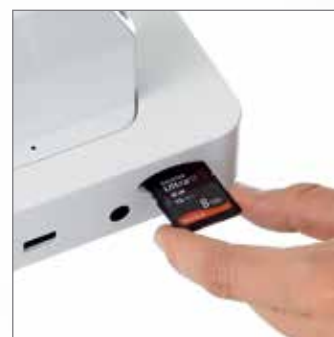
Save the image to your computer or SD card.