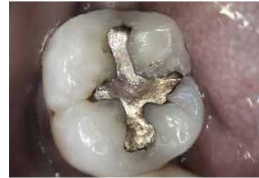
Visualize the smallest details with crystal-clear views and true-to-life colors.

Like the human eye, the CS 1500's patented liquid lens technology* automatically focuses according to the distance between the camera and the filmed object—no manual adjustments required. You simply enjoy effortless image capture and clear, detailed images every time.