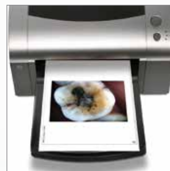
Print the image on any kind of printer.