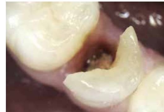
Receive crystal-clear views and true-to-life colors.